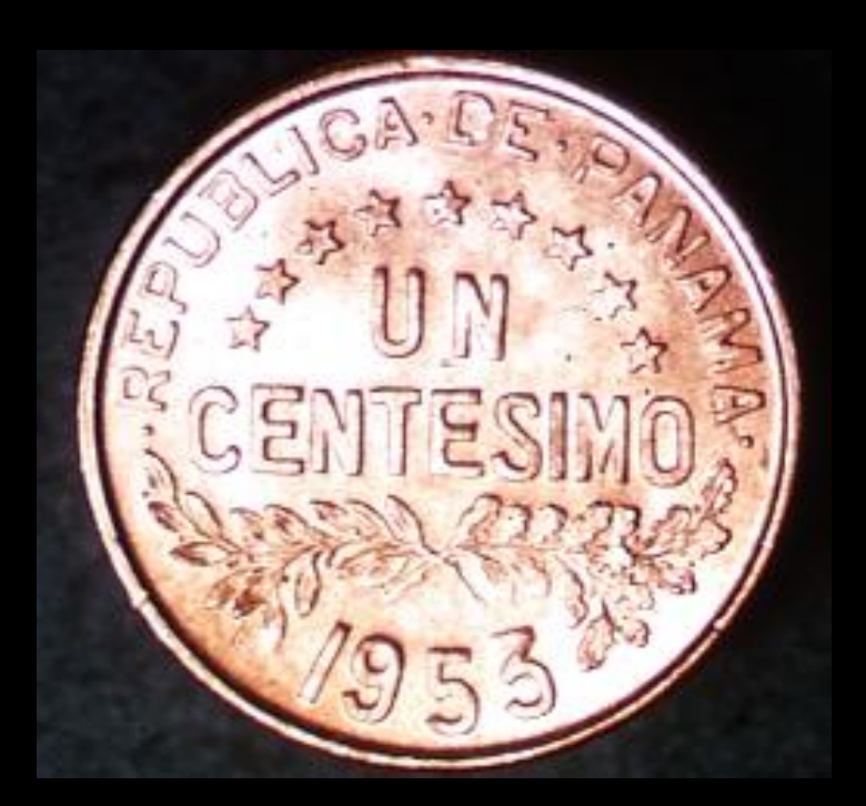
This is a 1 Centesimo, a minor copper coin, commemorating the 50<sup>th</sup> anniversary of Panama.

Obverse is a Urraca, a chief of the native peoples who waged guerilla warfare against the Spaniards for 9 years.